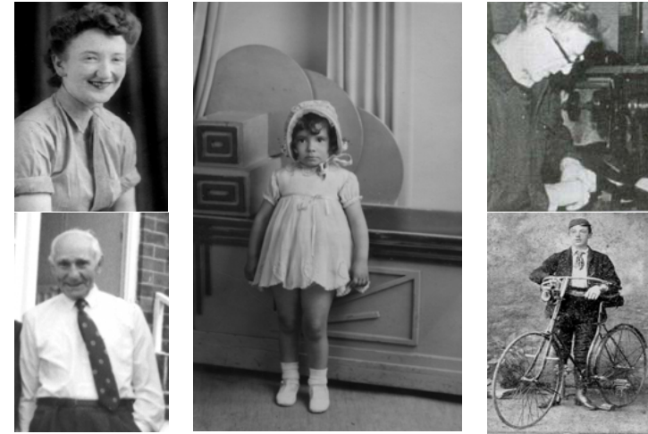
A MISCELLANY OF 20 th CENTURY MEMORIES FROM THE OLD WHICKHAM URBAN DISTRICT