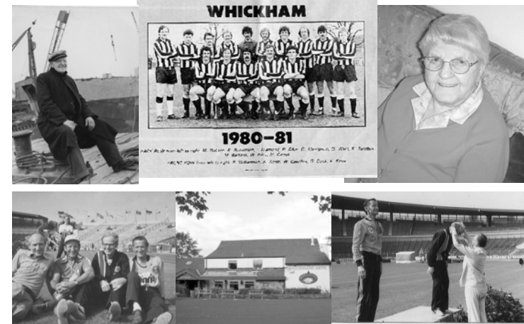
A MISCELLANY OF 20TH CENTURY MEMORIES FROM THE OLD WHICKHAM URBAN DISTRICT. PART 3