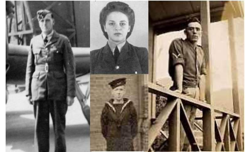
AN ORAL HISTORY OF WHICKHAM URBAN DISTRICT PART 2: REMEMBERING WORLD WAR TWO