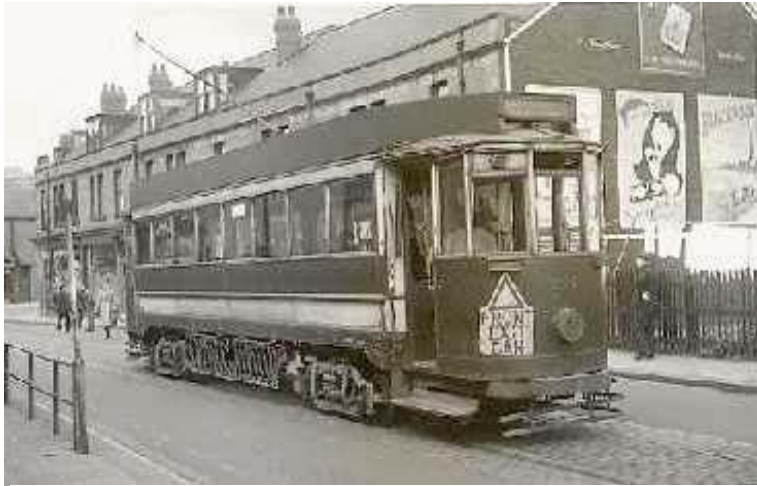
AN ORAL HISTORY OF WHICKHAM URBAN DISTRICT PART 3: AFTER THE GREAT WARS TO THE MILLENNIUM