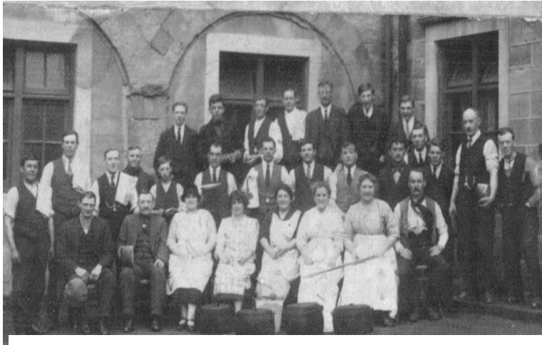
AN ORAL HISTORY OF WHICKHAM URBAN PART 1: FROM 1900 TO WORLD